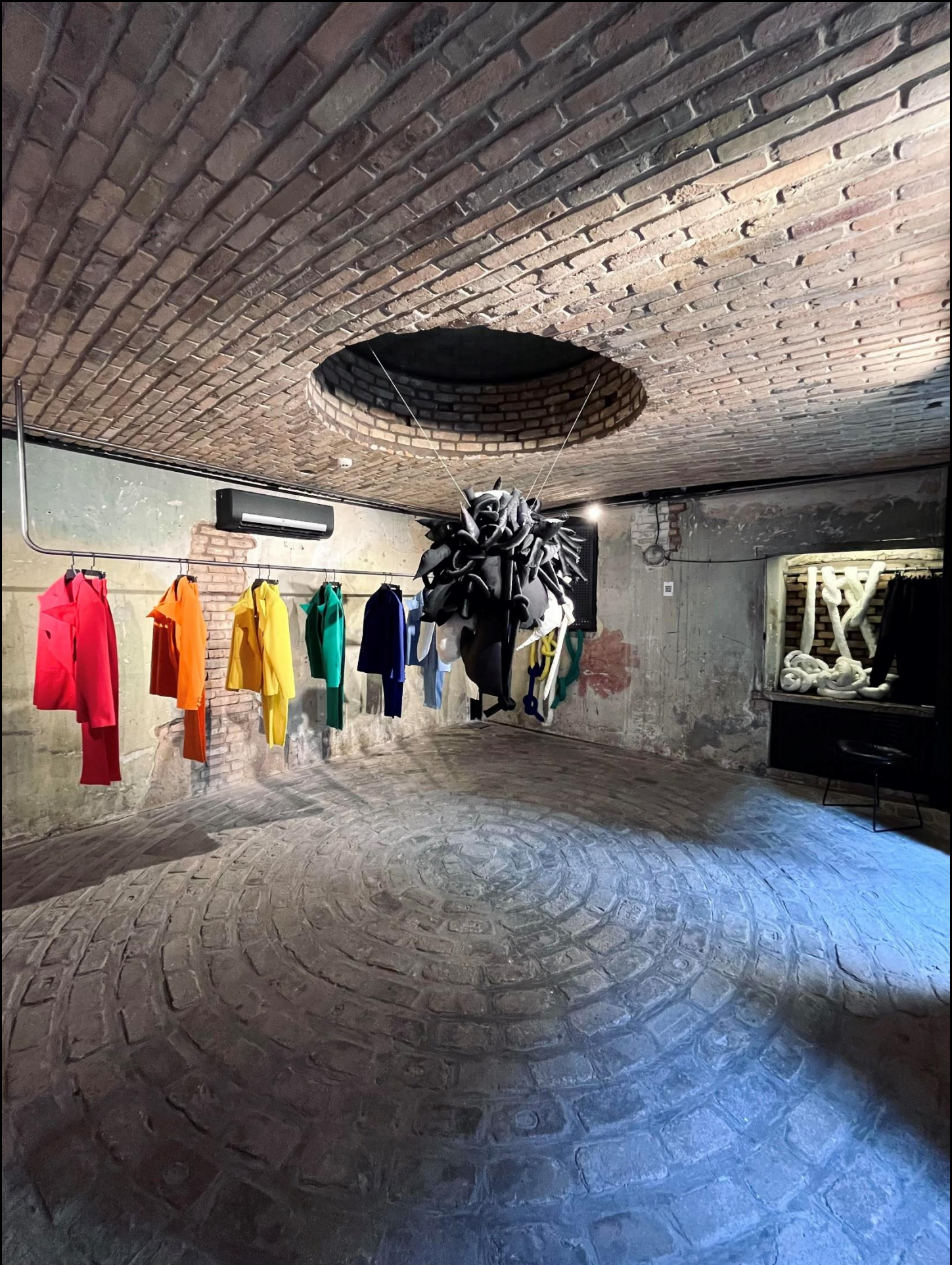
Voice of body By Farda Design